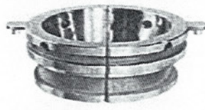
INSERT BOWL 2